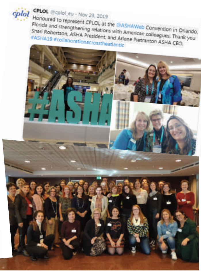
Our exciting Start-Up Meeting in Rome in November 2019